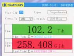
Flux totalizer display