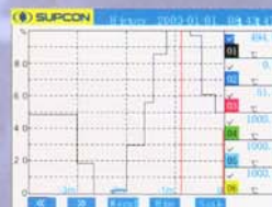
6 Channels historical trend