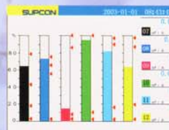
6 Channels bargraph