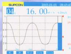
Real-time single channel trend